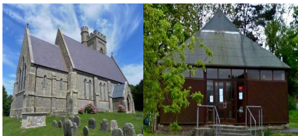
St Andrews & St Peters Fairlight